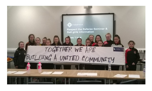
Official Ball Girl Course

The second 'Super Sunday' since the Christmas break took place on Sunday 20<sup>th</sup> March; Carnmoney A, Carnmoney B, Cliftonville and St. Marys entered, relishing the opportunity for their u13's to experience 11 aside football; Each team showed positive signs of improvement since the previous 'Super Sunday' held in February.