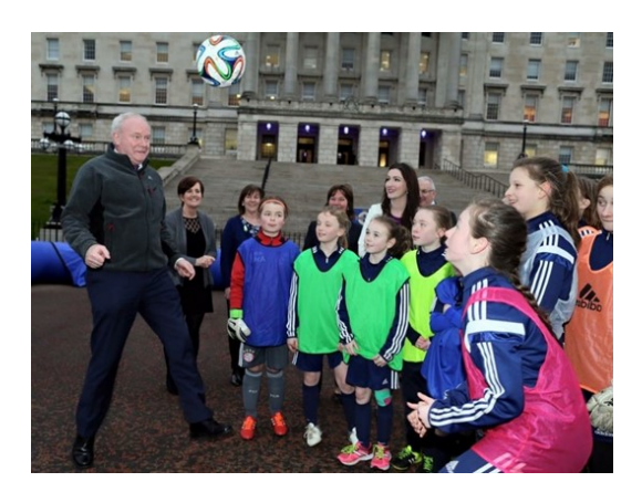
International Women's Day